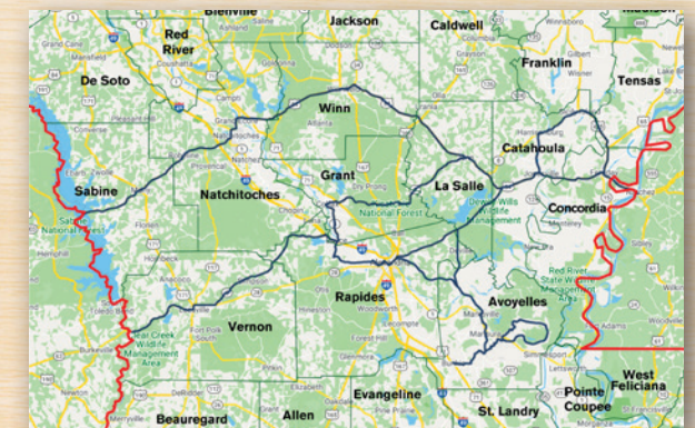
The complete Colonial Trail from east to west Louisiana.

Enjoy Central Louisiana's history of colonialism and development through its characters, colloquialisms, and charm. Louisiana Colonial Trails is a network of scenic byways, and routes threaded throughout ten Louisiana parishes originally used by pioneers to settle the west after the Louisiana Purchase of 1803. Few people think of Louisiana as a western frontier, but at the time of the Louisiana Purchase, the new nation was less than twelve years old, and most of the territory was uncharted, noted as Indian territory, or was in boundary disputes. Many of the trails followed by the pioneers were old Indian or animal paths. Historic trails such as the Natchez Trace, El Camino Real, and Nolan's Trace became a haven for land pirates, outlaws and bandits. Uncover the experiences along the trails and take some time to appreciate our local and regional attractions. You'll find characters and charm that entice you to journey paths of the pioneers and those that followed.